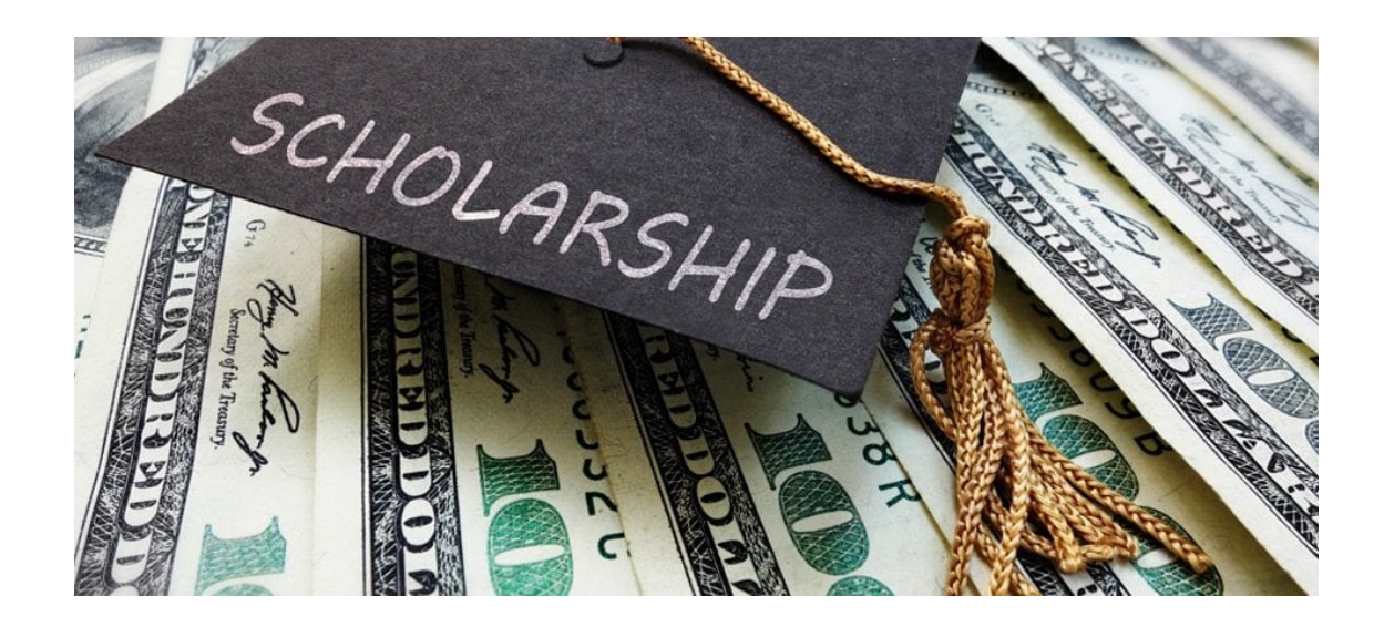
Happy Friday everyone!

I'm pleased to announce that the Financial Aid Office is partnering with the lovely Writing Center for a project that is near and dear to my heart. We will be hosting a Scholarship Workshop October 23rd from 6pm to 7pm at the Writing Center (MCC 212) for current Cornish students! This is a time dedicated for you- the students- to get together and work on applying for scholarships. I, along with our wonderful Writing Center Consultants, will be there to facilitate, answer questions, and give tips and tricks for applying to scholarships. We want to make this as easy a process as possible and let you know that you are not alone! We are here to help!